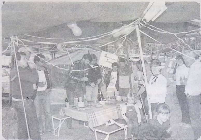
Cocktails at Jumpsuit Jack's erection party.